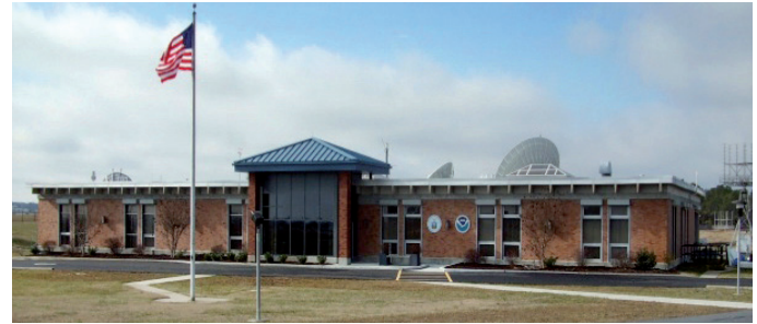
Wallops Command and Data Acquisition Station