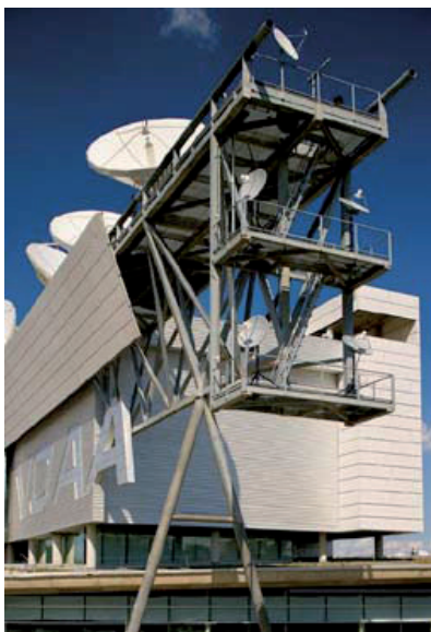
NOAA Satellite Operations Facility

Ground support is critical to the GOES-R mission. NOAA developed a state-of-the-art ground system that receives data from GOES-R Series spacecraft and generates real-time data products. This is accomplished via a core set of functional elements, which include space/ground communications, raw data processing, monitoring satellite health and safety, and commanding the spacecraft and instruments, as well as a new antenna system and a product access component.